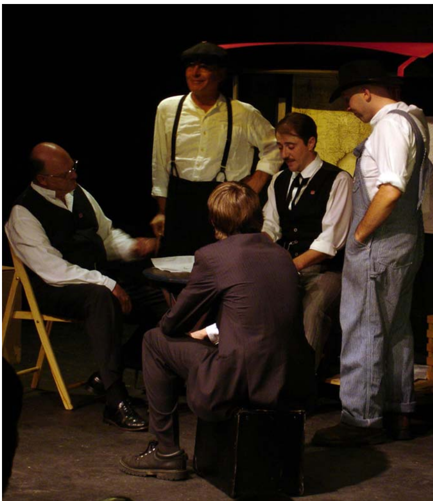
Willie: “Reporters here. Dignitaries here, at the point of impact. But 200 feet back like everybody else. The photography platform will be 100 feet back—and nine feet high.” Seamus (not pictured): “If the crash doesn’t kill them, the fall will.”