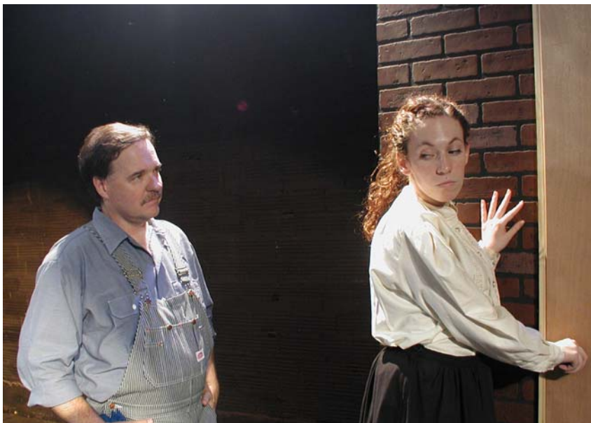
Seamus to his daughter Margaret: “Stay away from Crush. He’s bad for you.”