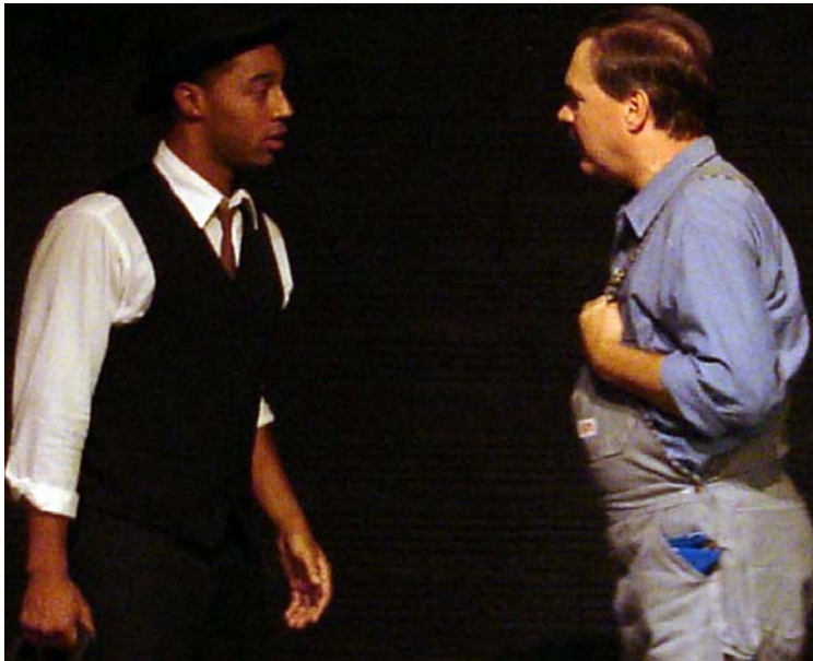
Seamus to Scott Joplin, “Ye’d best be gettin’ back to yer coon town where ye’ll be safe.”